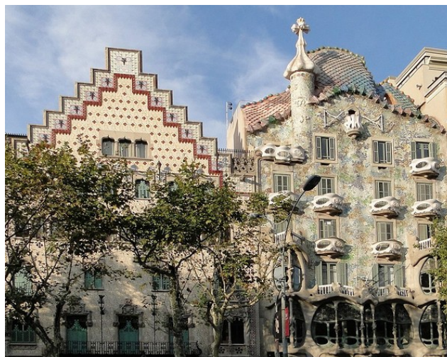
Partial view of Block of Discord at Passeig de Gracia